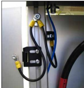
ESD version Part No. 78201-010091