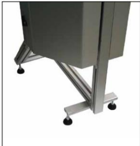
Stand version Part No. 78201-010089