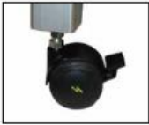
Lockable Wheels Part No. 78201-010088