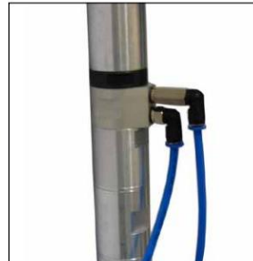
Air cursor Part No. 78201-010087