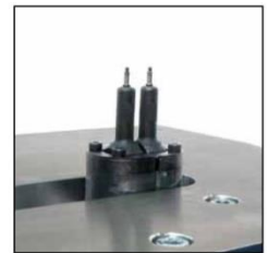
Riveting pitch reduced to 17 mm can be realised with the CP (close pitch) version.