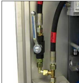
Single module switch-off Part No. 78201-010090