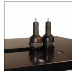
Standard nose equipment

** For fasteners < \varnothing 2.4 mm the air cursor option is recommended